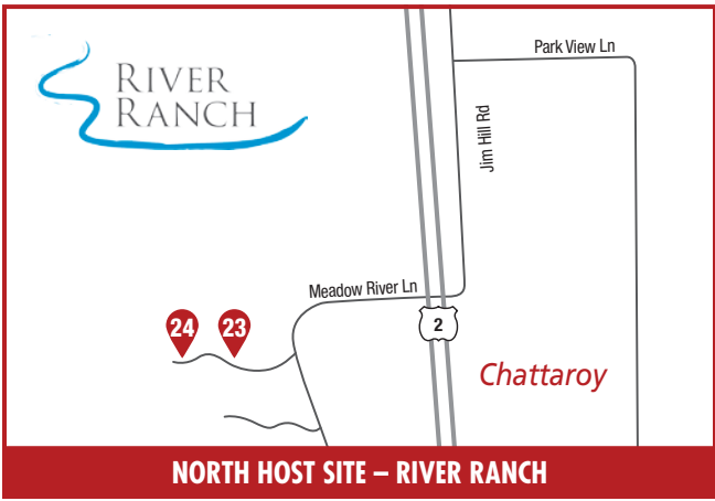
NORTH HOST SITE – RIVER RANCH