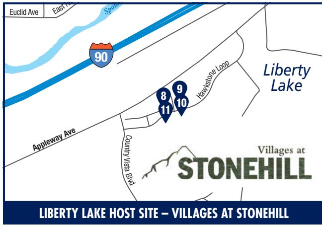
LIBERTY LAKE HOST SITE – VILLAGES AT STONEHILL

PUBLISHER'S NOTICE: The information herein is intended to be an accurate representation of existing records. E&M Consulting, Inc. reserves all rights to the information contained in this document, be it cartographic or other. E&M Consulting, Inc., and its employees are not responsible for the goods or services, whether expressed or implied, rendered by any of the companies advertising. Copyright laws protect all information. E&M Consulting, Inc. assumes no liability for errors or omissions. No information may be reproduced, copied, or stored in any form without the written consent of E&M Consulting, Inc.